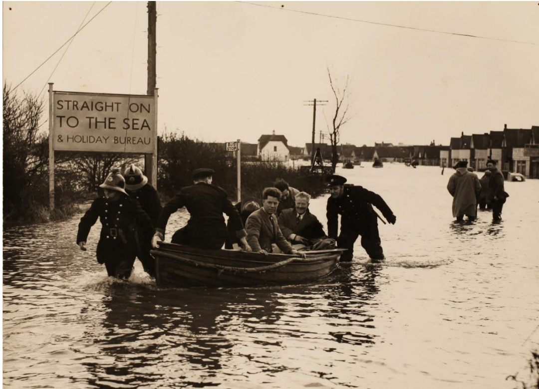
Rescuers in Jaywick (D/Z 35/15)

The Essex Sound and Video Archive preserves radio broadcasts, oral histories, and videos relating to the 1953 North Sea flood on Essex.